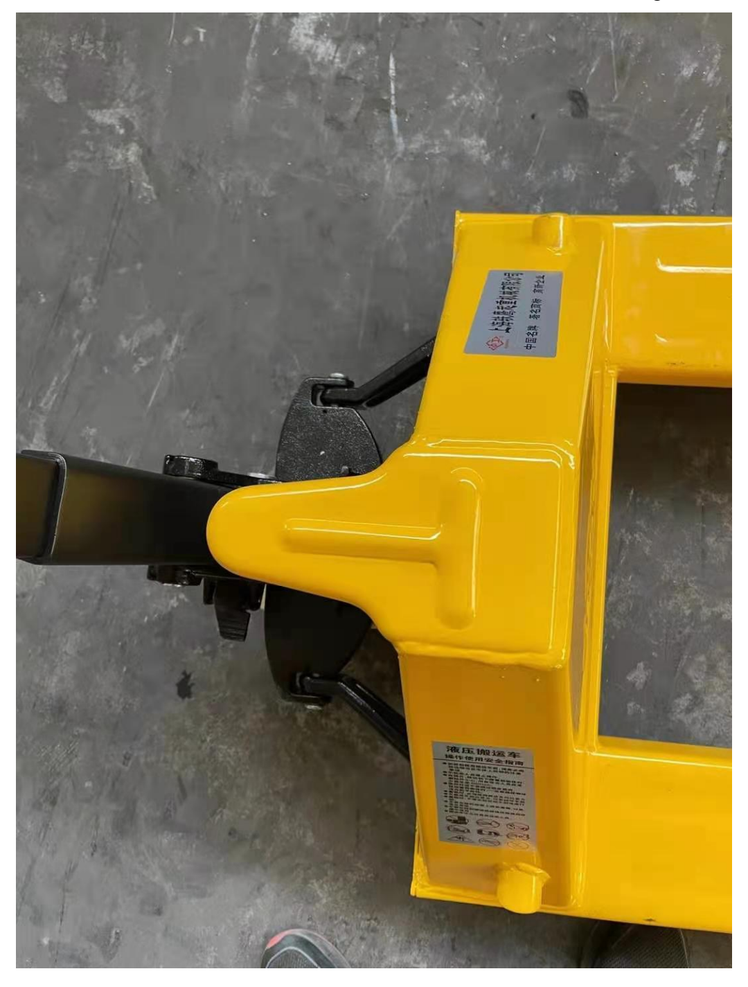
HUGO Premium Pallet Jack Truck with Small nylon entry and exit rollers prevent physical exertion of the operator and protect load rollers and pallet Helper Rollers For Easier Pallet Entry makes it easier to move heavier loads on the hand pallet jack resulting in less effort / strain for the operator.