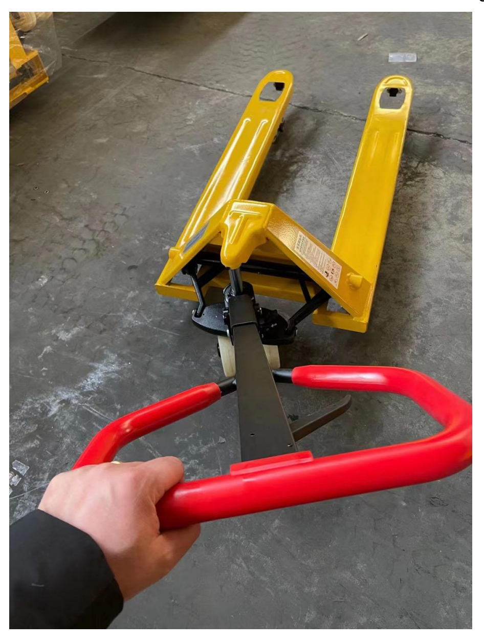
3. HUGO Premium Pallet Jack Truck Rocker arm widened and thickened can ensure the long life.