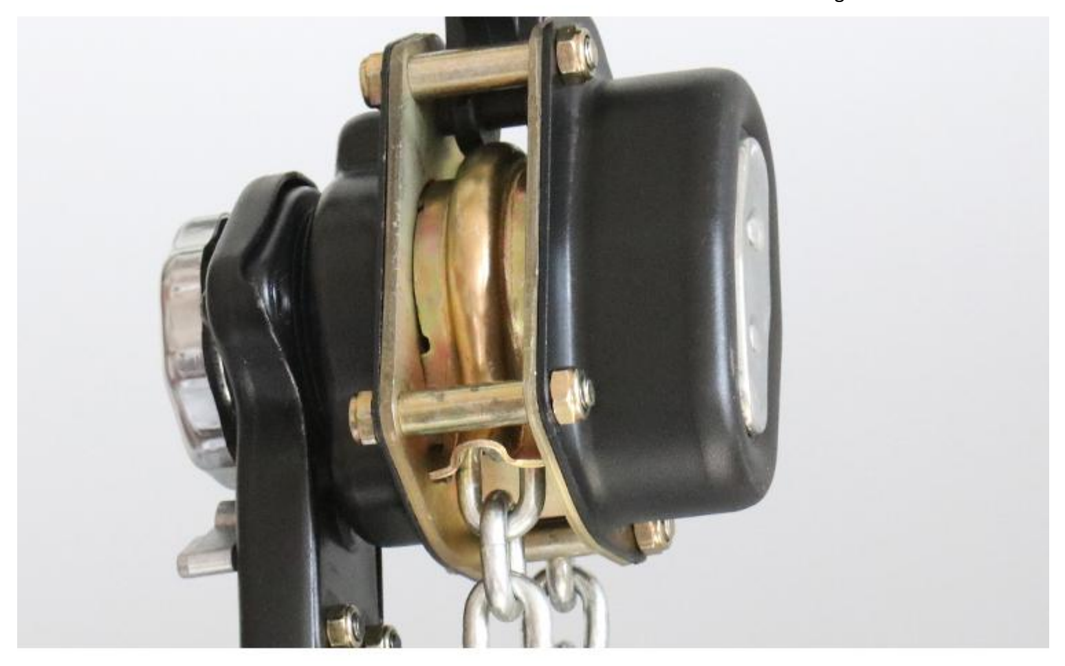
4.G80 Chain are made of special alloy steel that is exclusively