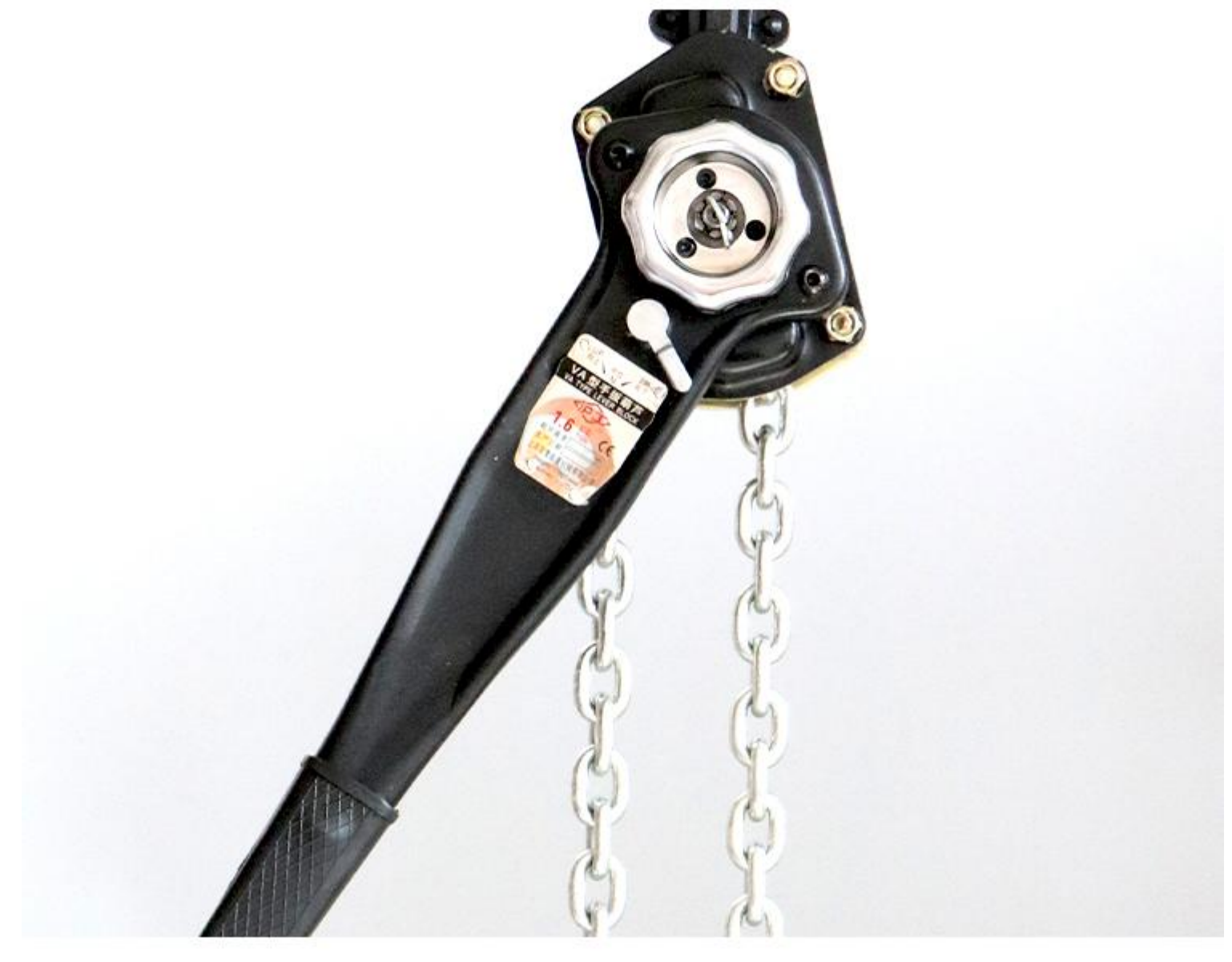
3..Build-in mechanical load brake.Two swivel hook with safety latches